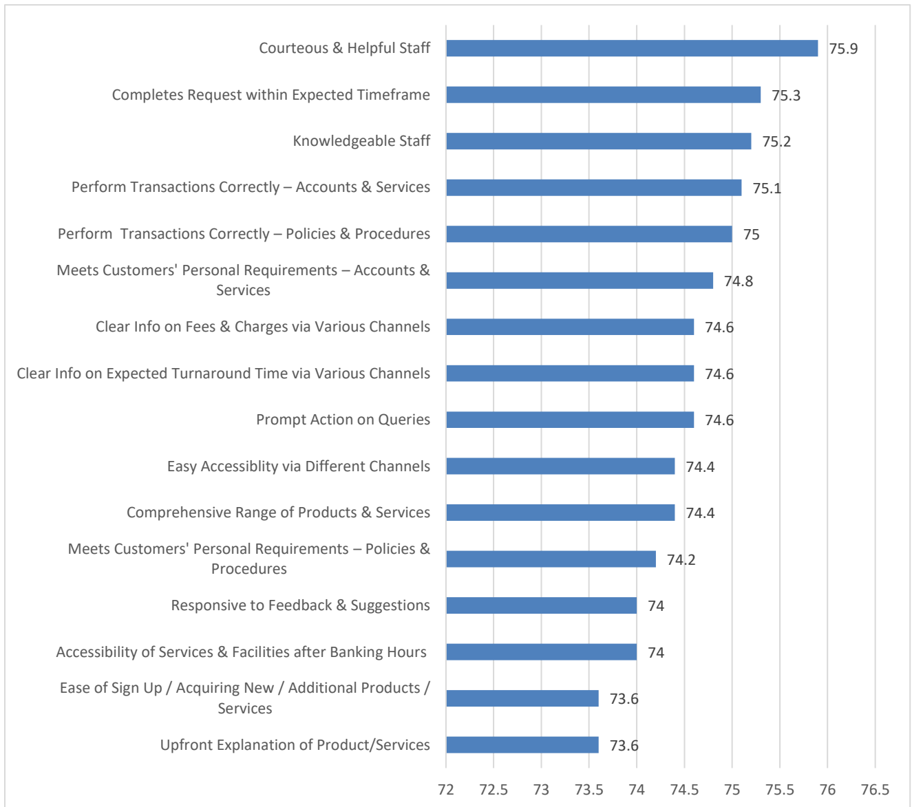
Figure 1 – Performance Indicators on a 0 -100 Index Score with 0 - Lowest score & 100 Highest Index